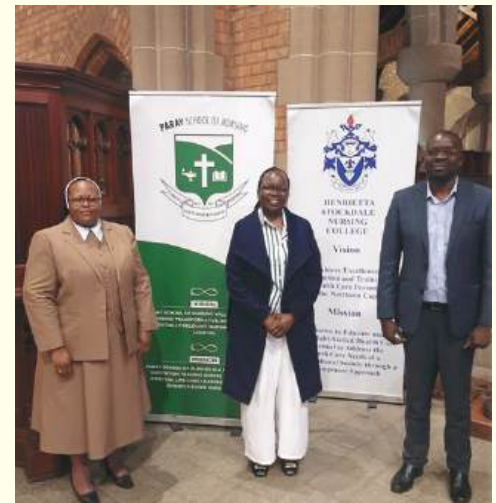
Collaborative Partners from Paray School of Nursing in Thaba Tseka in Lesotho.

The event was jointly coordinated by St Cyprian's Cathedral, and the Historical Society of Kimberly and Northern Cape, Henrietta Stockdale College of Nursing and sponsored by Lenmed Nursing College.